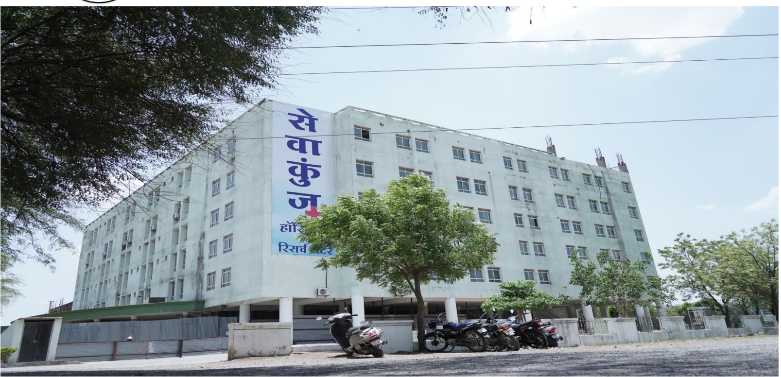
BUILDING OF SEWAKUNJ HOSPITAL