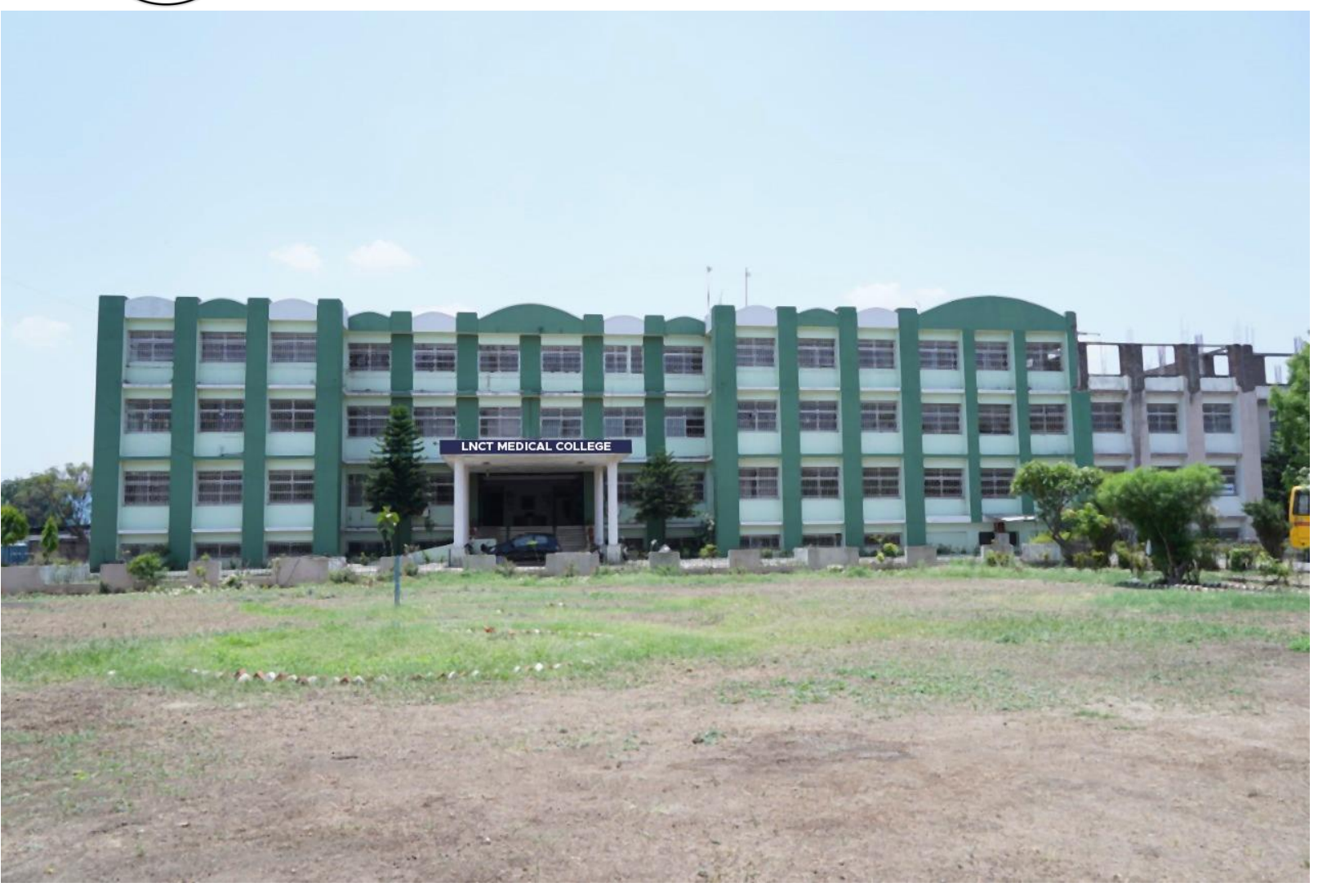
BUILDING OF LNCT MEDICAL COLLEGE